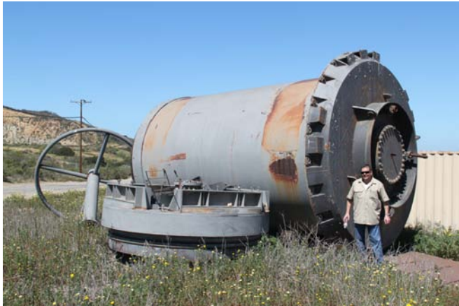
Rolf Lee stands next to the riser plug discarded when the Ocean Outfall pipeline was completed in 1999.

the 190 ft. drop shaft that connects the South Bay Land Outfall pipeline from the treatment plant to the Seabed Pipeline three miles offshore.