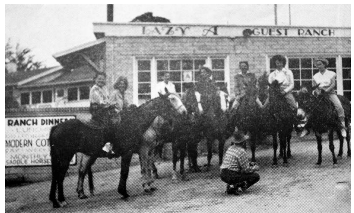
Lazy A Guest Ranch photo in 1950 Imperial Beach brochure.