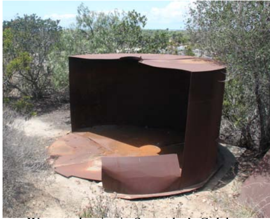
Water tank ruins in Smuggler's Gulch.

James E. Wadham, became an attorney and was elected mayor of San Diego 1911-13.