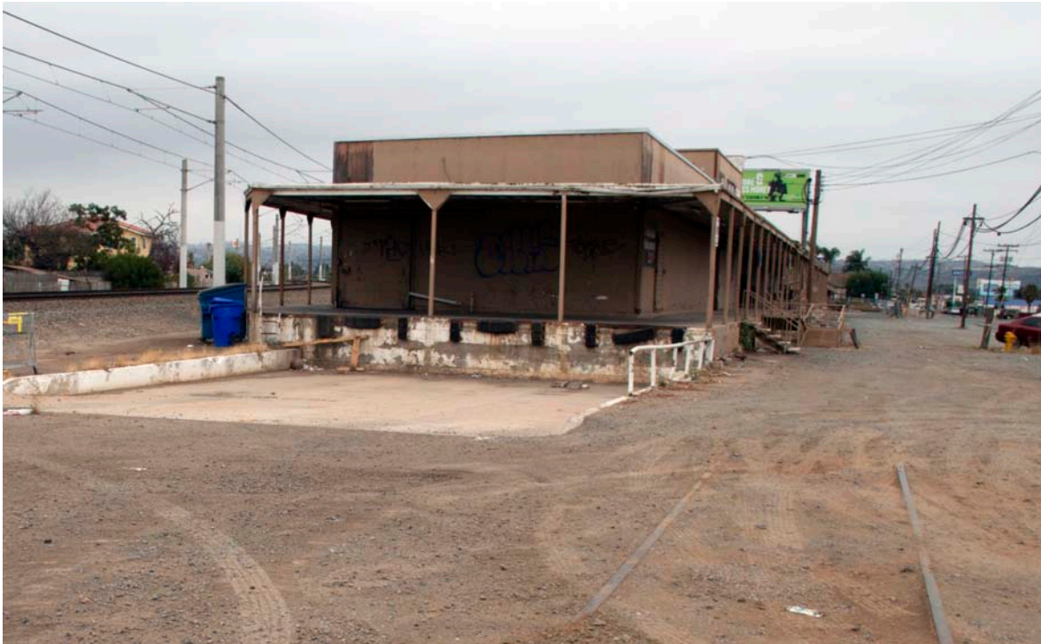
The Egger-Ghio Golden West Packing Co. was next to the tracks in Palm City.