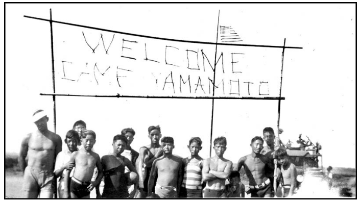
Camp Yamamoto was the first summer camp of Boy Scout Troop 52 in the Tijuana Slough in August, 1933.

61 - The Community Garden is located on county property in the flood plain of the Tijuana River.