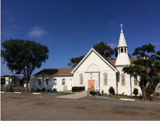
Nestor Methodist Church was built in 1896.