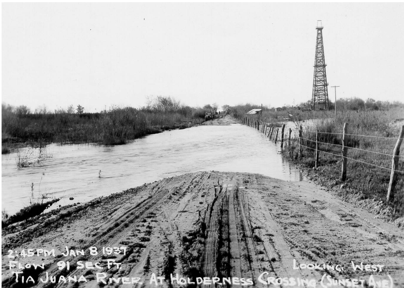
Sunset Avenue was unpaved and frequently flooded (1937 photo).

10 - The Abner Whitely ranch of 160 acres was located on the north side of Oneonta and eventually was absorbed into the suburbs of Imperial Beach. However, two adobe homes survive today from the Whitely ranch, one owned by Dick and Jackie Palmer on Beverley Avenue, and one by Brian Bilbray on 9th Street. Oneonta Elementary School was opened in 1960.