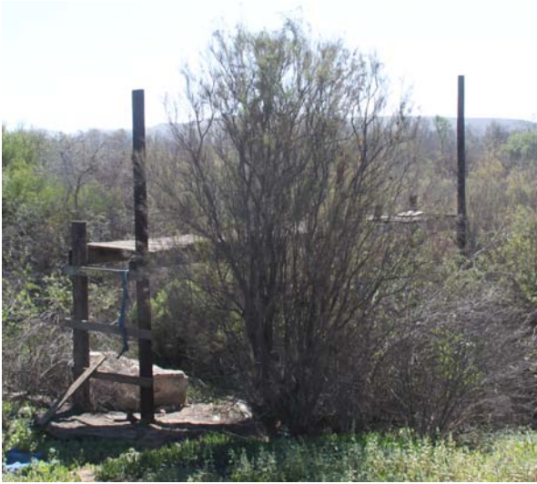
Ruins of the 1936 Cal Water plant in Bird & Butterfly Garden.

67 - The Dick Brown ranch at 2336 Hollister Street was located across the road from the water treatment plant in 1965.