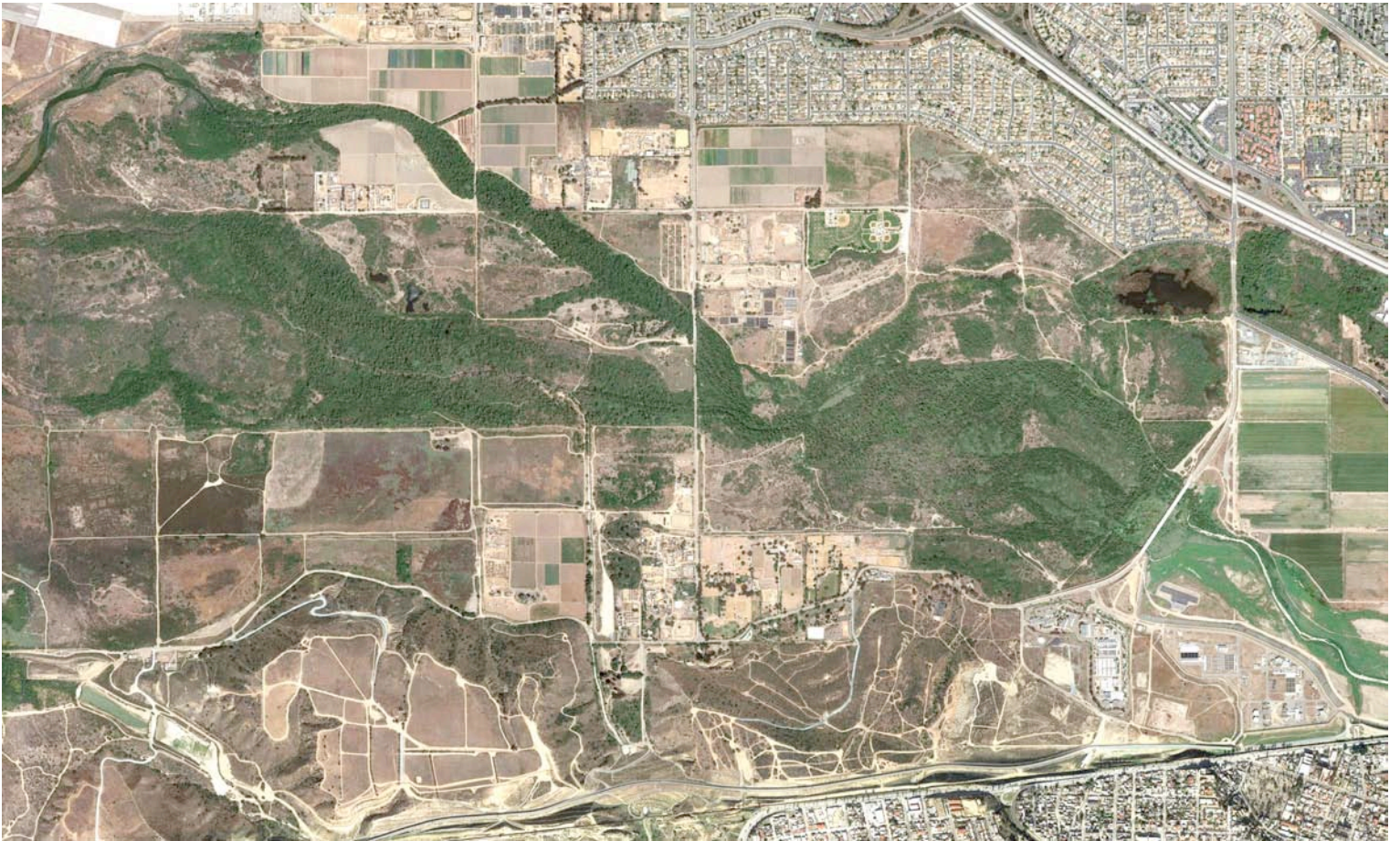
The top view shows the patchwork of the many farms and ranches in the valley in 1966. In the 2015 view below, the regional park has returned most of the river bottom land to a natural state, and suburbia is encroaching from the north.