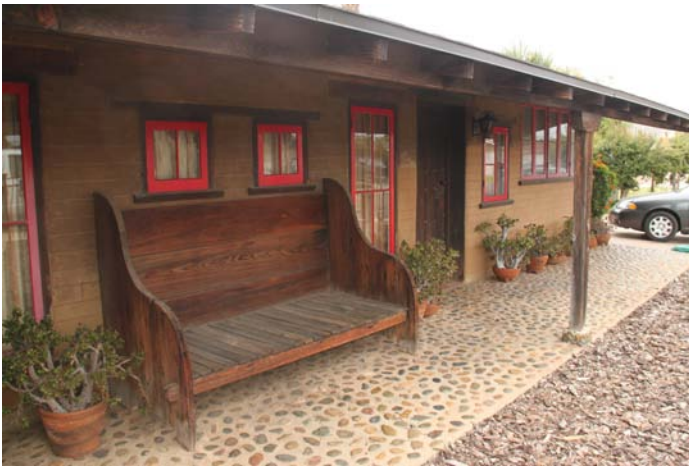
Palmer adobe on Beverley Ave dates from the Whitely Ranch.