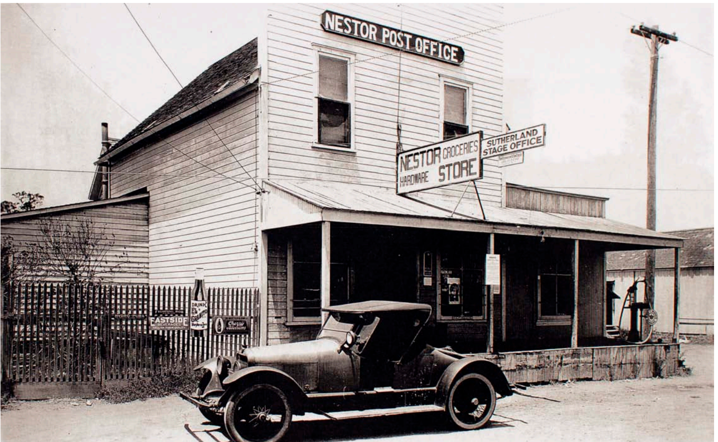
The building of the Nestor store and post office is still located at Hollister and Coronado.

30 - Palm City was a station of the National City & Otay railroad in 1887 and on the San Diego & Arizona Railroad in 1910. It was an important junction of County Road No. 1 (Hollister Street after 1957) that ran south to the border, and Palm Avenue that became state highway 75 to