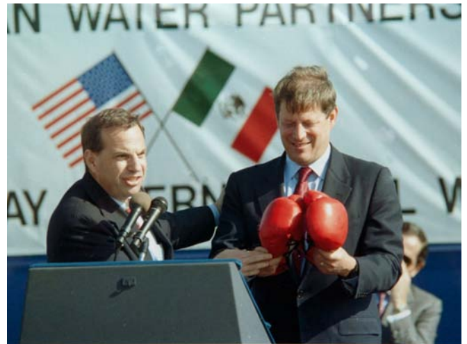
Rep. Bob Filner gave red boxing gloves to Vice-President Al Gore at the the IBWC plant dedication July 16, 1994, to thank the vice president for "delivering a knockout blow to Tijuana sewage in this river valley." ( Union July 17, 1994)

93 - International Treatment Plant was constructed by the International Boundary and Water Commission in 1997. After the failure of the dissipator pools to stop the sewage flow in the floods of 1980 and 1982, the city's O'Leary Report of 1983 recommended the construction of the treatment plant and ocean outfall pipe. Construction of the 75-acre treatment plant began in 1994 with a groundbreaking ceremony July 15 featuring Vice-President Al Gore. Construction of the plant was finished in April, 1997, and the ocean outfall pipeline was finished in Jan. 1999.