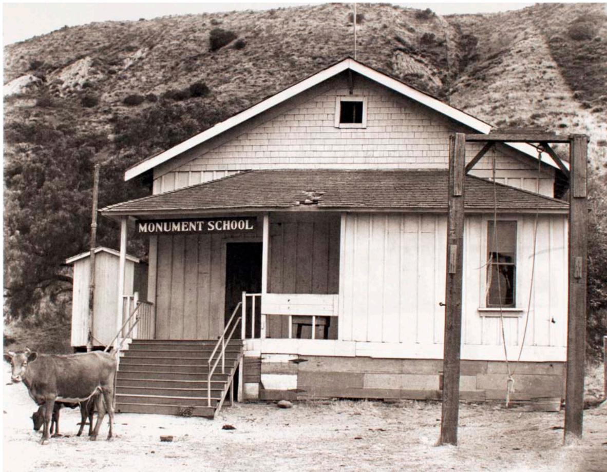
Monument School was the oldest school in the county when this photo was taken in 1938.