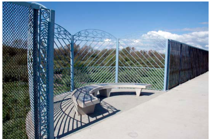
Public art on the Dairy Mart Bridge dedicated 1999.