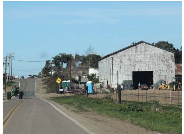
The Egger farm and barn on 19th Street.