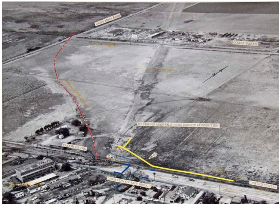
Old Dairy Mart Road in the center of this photo ended at Gate No. 2. The Cozza Farm is shown near the top and the Hofer Dairy is shown at the location of the flood gates, bottom left (Oct. 11, 1966,).