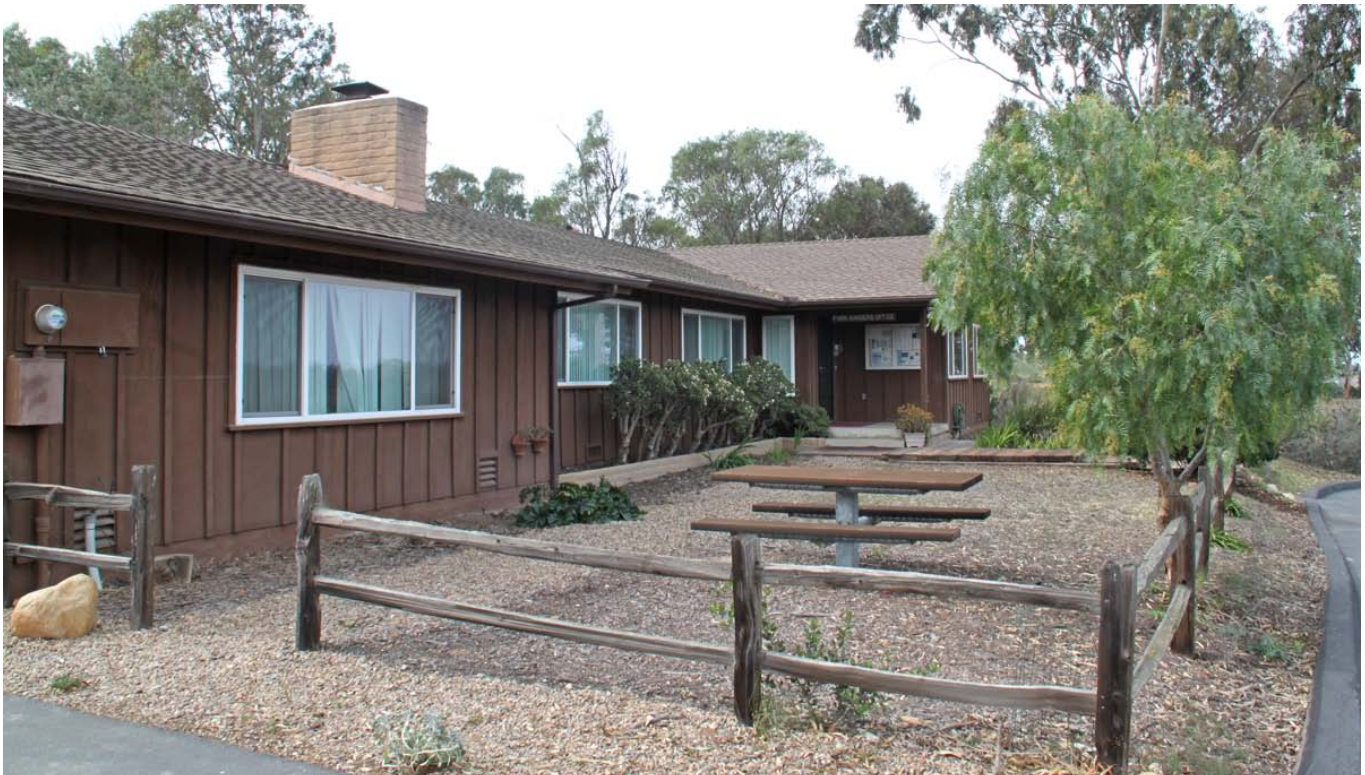
Shelton Ranch house built in 1970, now park ranger headquarters.