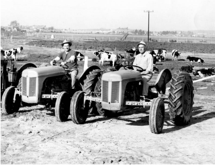
Louis Shelton (r.) and Willy Layton in 1951.

to Dairy Mart Road and farmed until the International Treatment Plant was built.