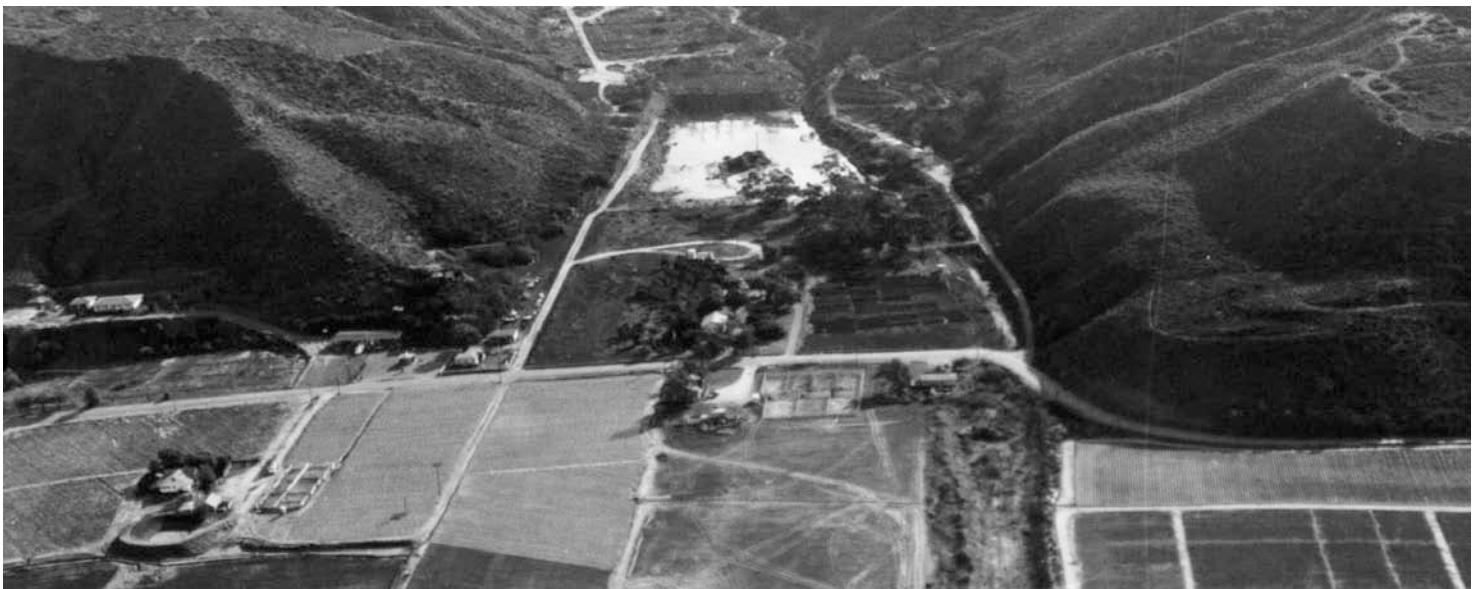
A large pool of water in the center of Smuggler's Gulch in 1966 was caused by the excavations of Conrock for sand and gravel. Jim Martin's ranch is at lower left (Photo courtesy of IWBC).

111 - The gate to Border Field State park was erected soon after the dedication in 1971 and a concession company was hired to collect the $1 per car admission fee. In 2014, a public art project was installed on the fence, known as the "The Border Field Gateway to Nature Communitree." Volunteers collected objects from the valley to be embedded in the display that represents the Park's native Elderberry Tree. Next to the gate is the Ocean Outfall Anti-Intrusion structure with large cement cap on top of