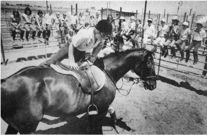
Girl Scouts at the Double WW Ranch ( IB Star Sep. 2, 1984).