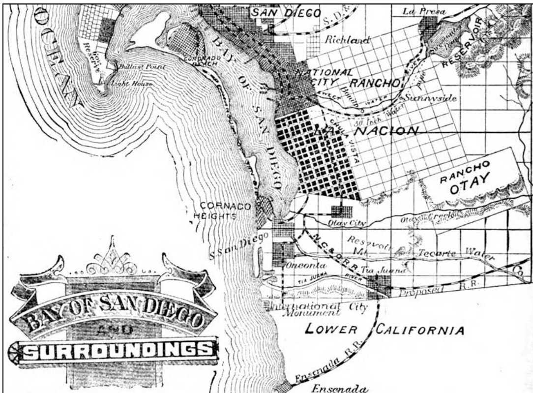
Map of the South Bay region from The Great Southwest magazine, May 1891.

6 - The Tijuana Slough is the salt marsh at the mouth of the Tijuana River. It is at the end of a river 120 miles long with a watershed of 1750 square miles, most of which lies in Mexico. The final 6 miles of river north of the border has changed course several times due to flooding, especially in 1895, 1916, 1927, 1980 and 1993. The