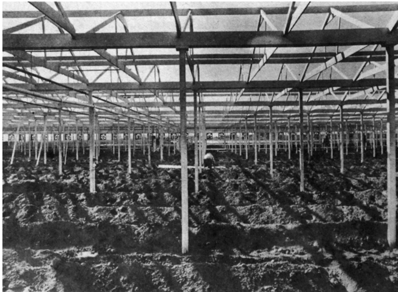
Chula Vista Star, Nov. 29, 1973

1973/08/16 - Sam Vener was exempted from the bayfront moratorium and allowed to build temporary greenhouses ( Chula Vista Star-News, 1973. )