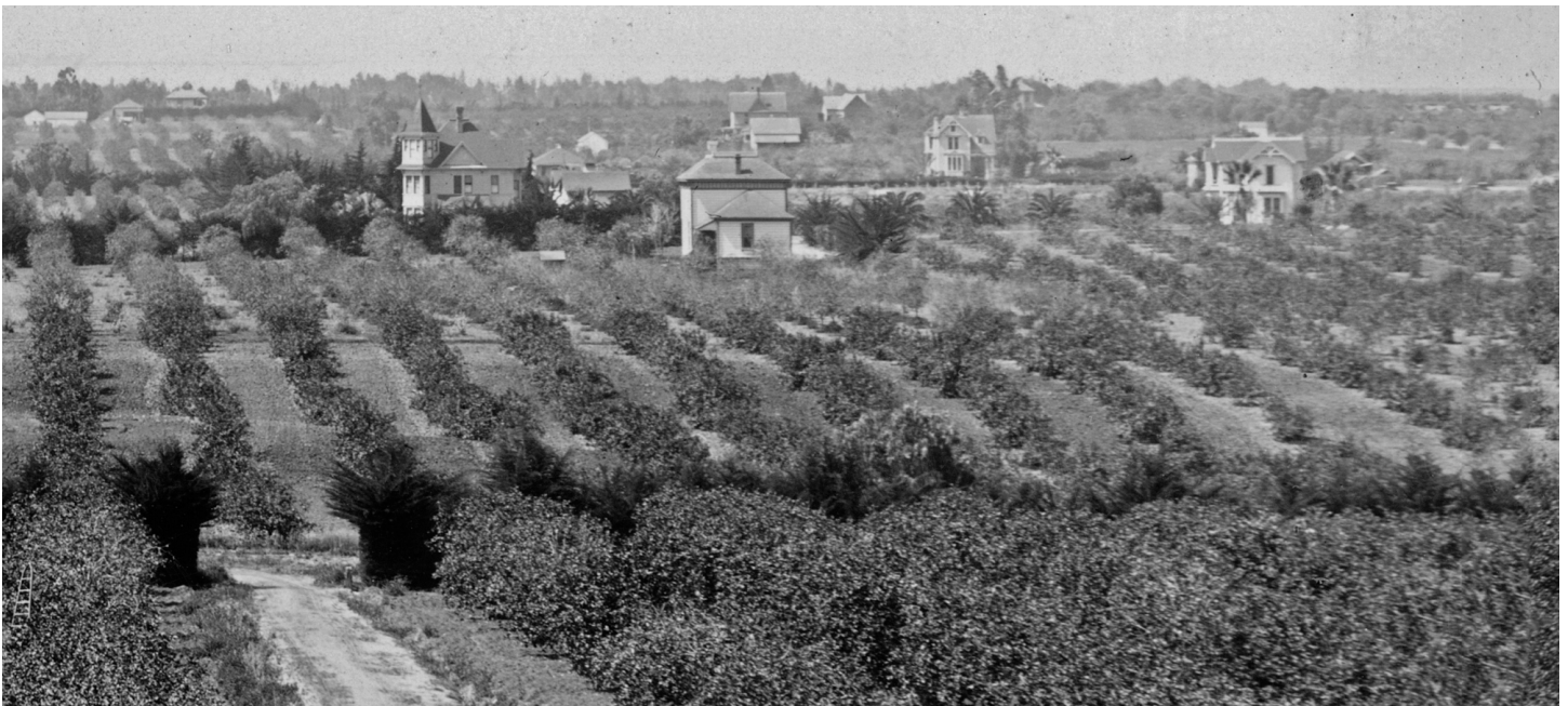
Chula Vista was developed in 1887 by the Santa Fe Railroad as an agricultural tract for five-acre lemon ranches and elegant orchard homes. The city of 846 was incorporated in 1911, and remained rural until World War II when its population soared to over 10,000.