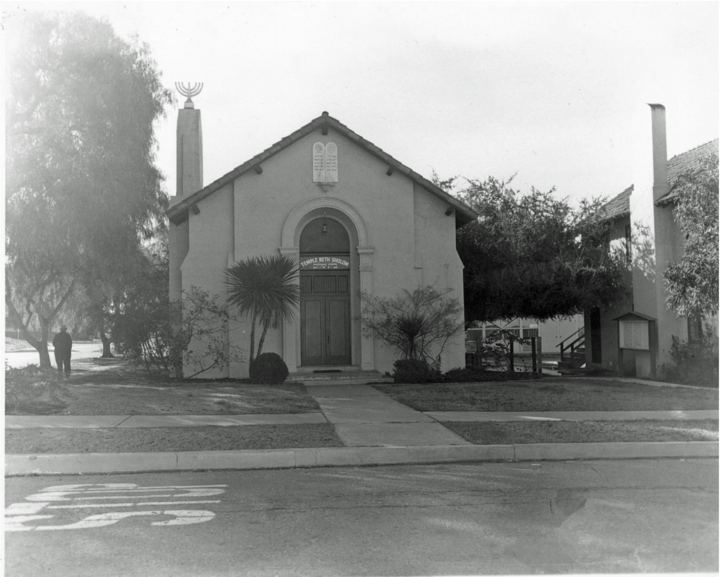
1958 Temple Beth Shalom