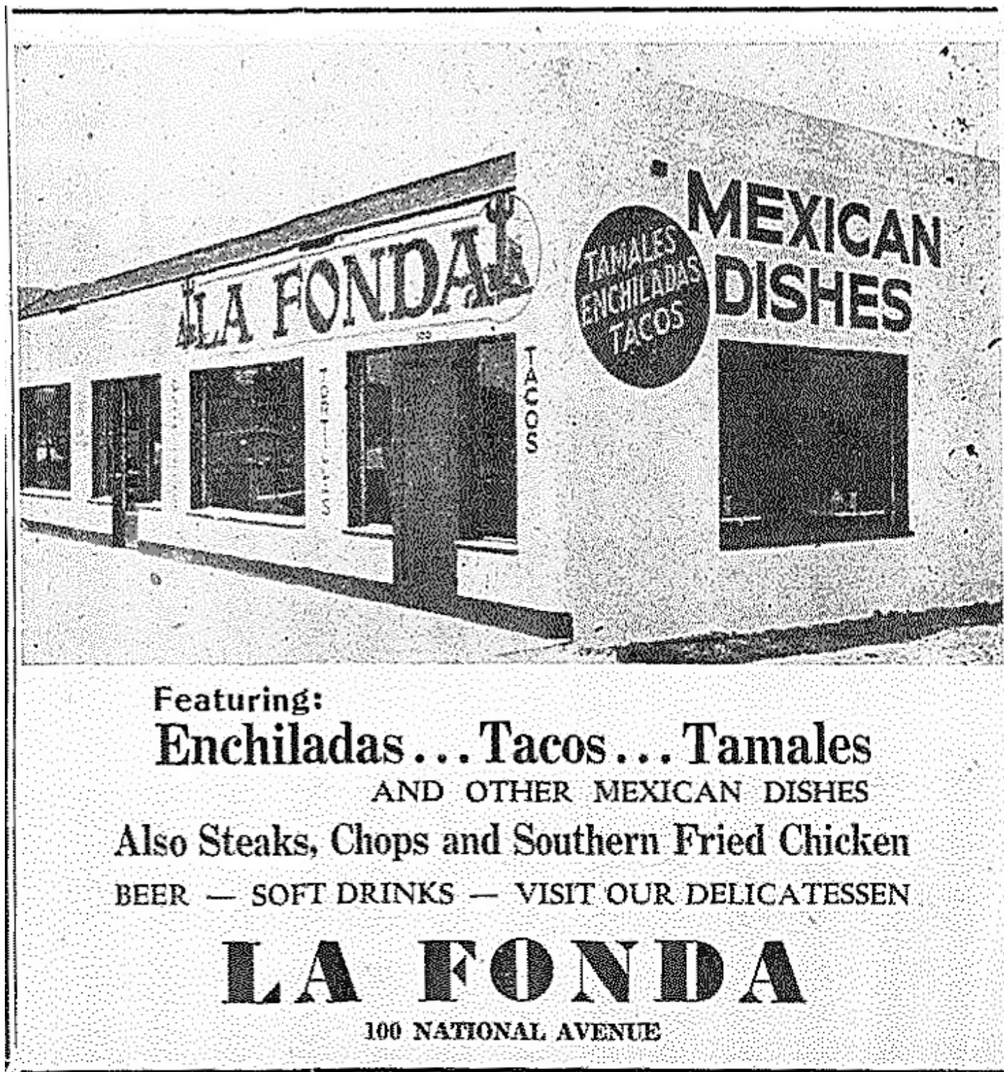
La Fonda from Chula Vista Star June 29, 1945