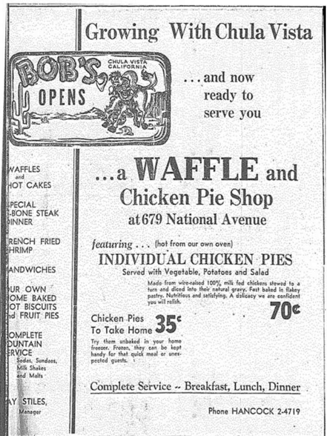
from Star 1951/8/23 and 1952/2/28