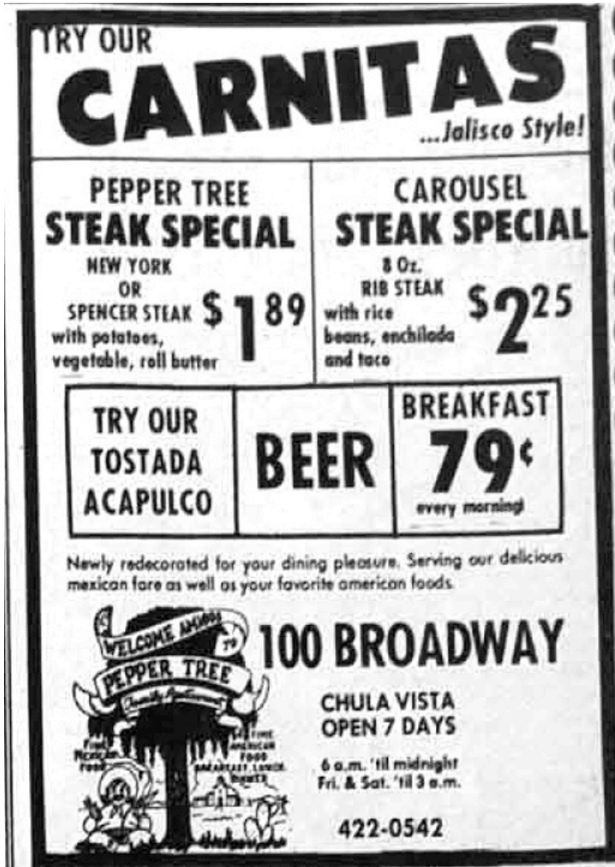
from Star 1972/6/1