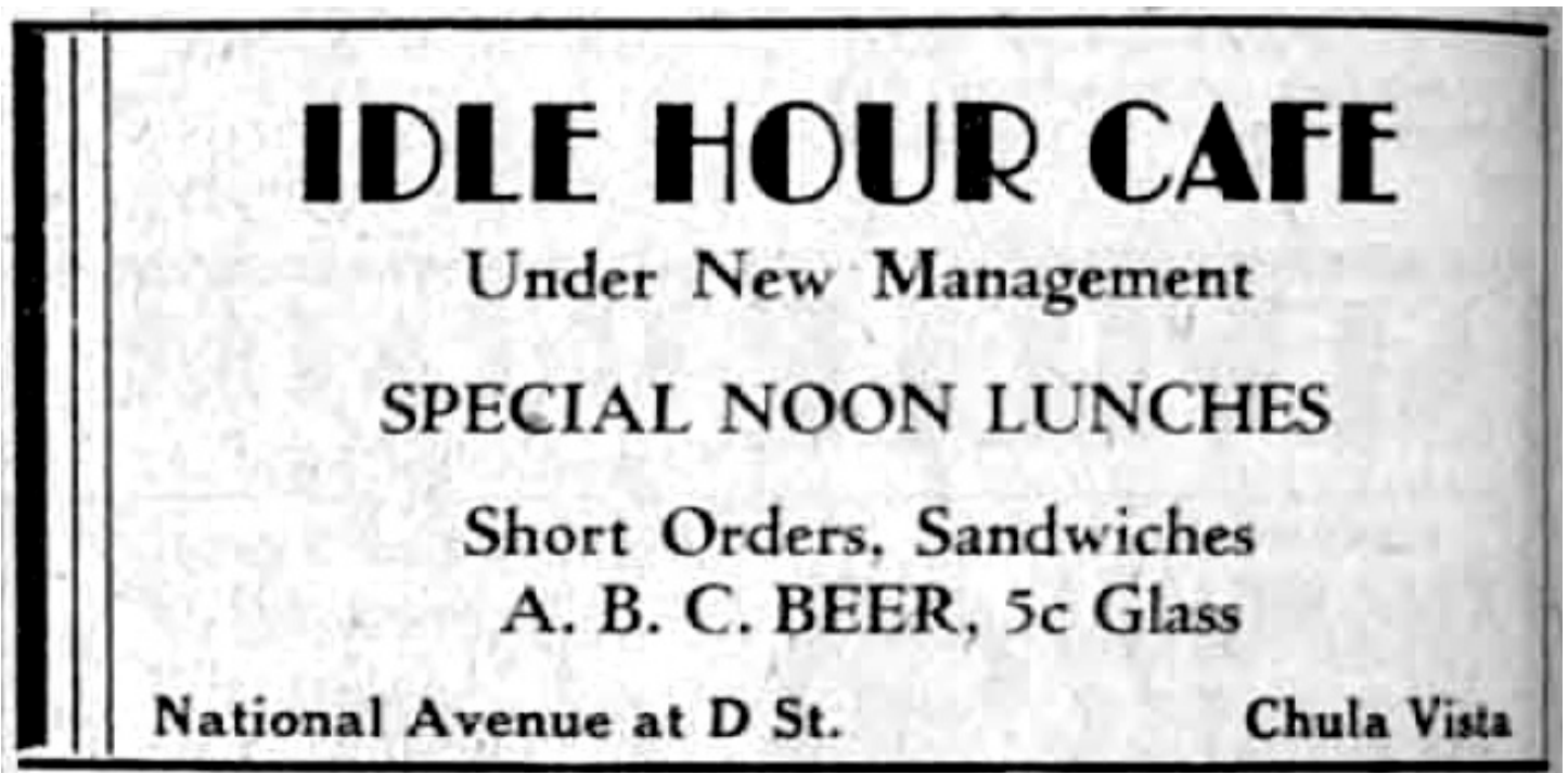
Idle Hour Cafe from Chula Vista Star Oct. 6, 1933