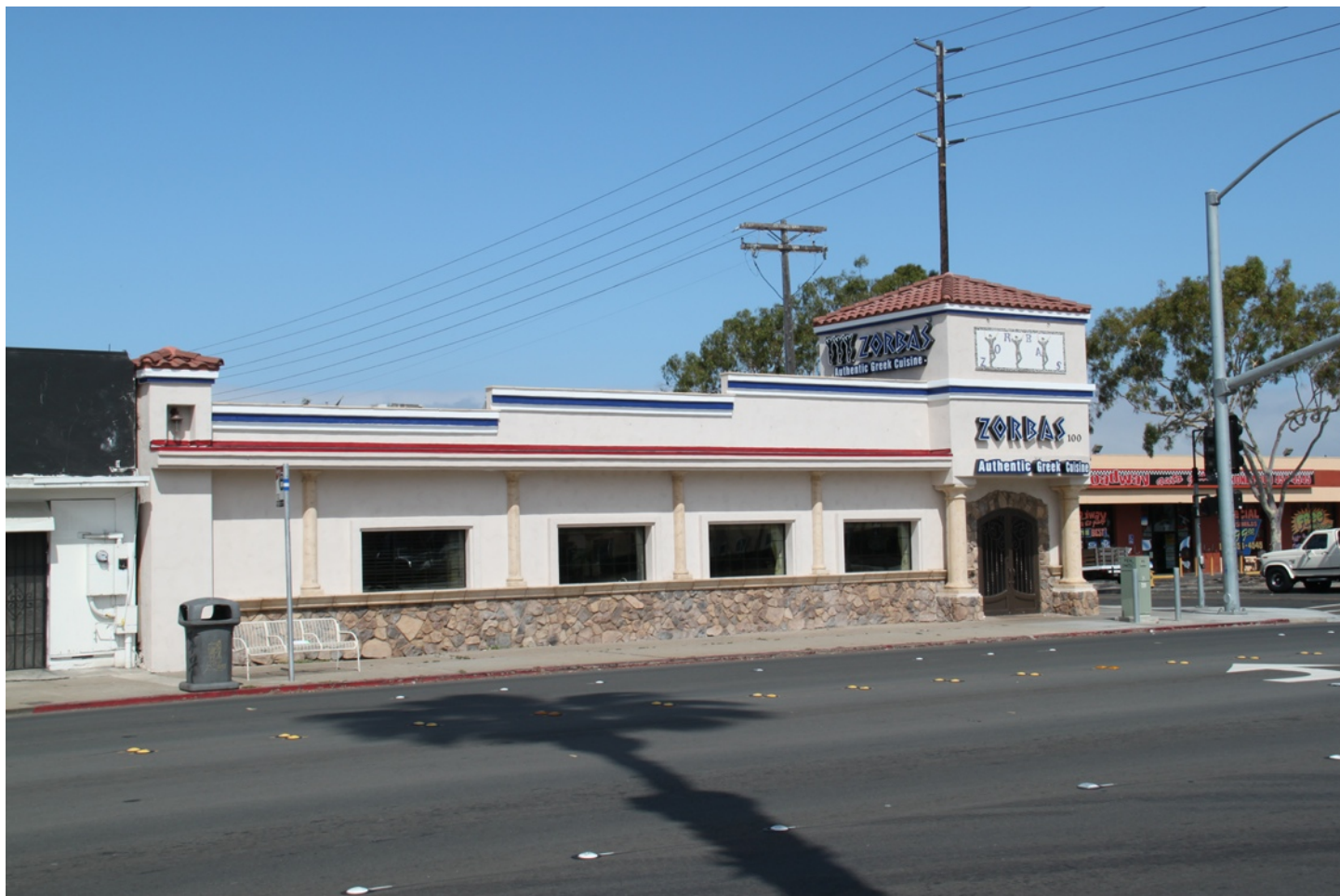
Zorbas at 100 Broadway, southwest corner at D Street.