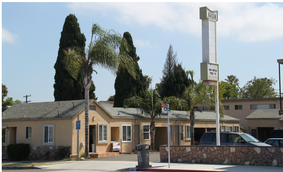
The Avon Motel is now on the site of the Chick Inn.