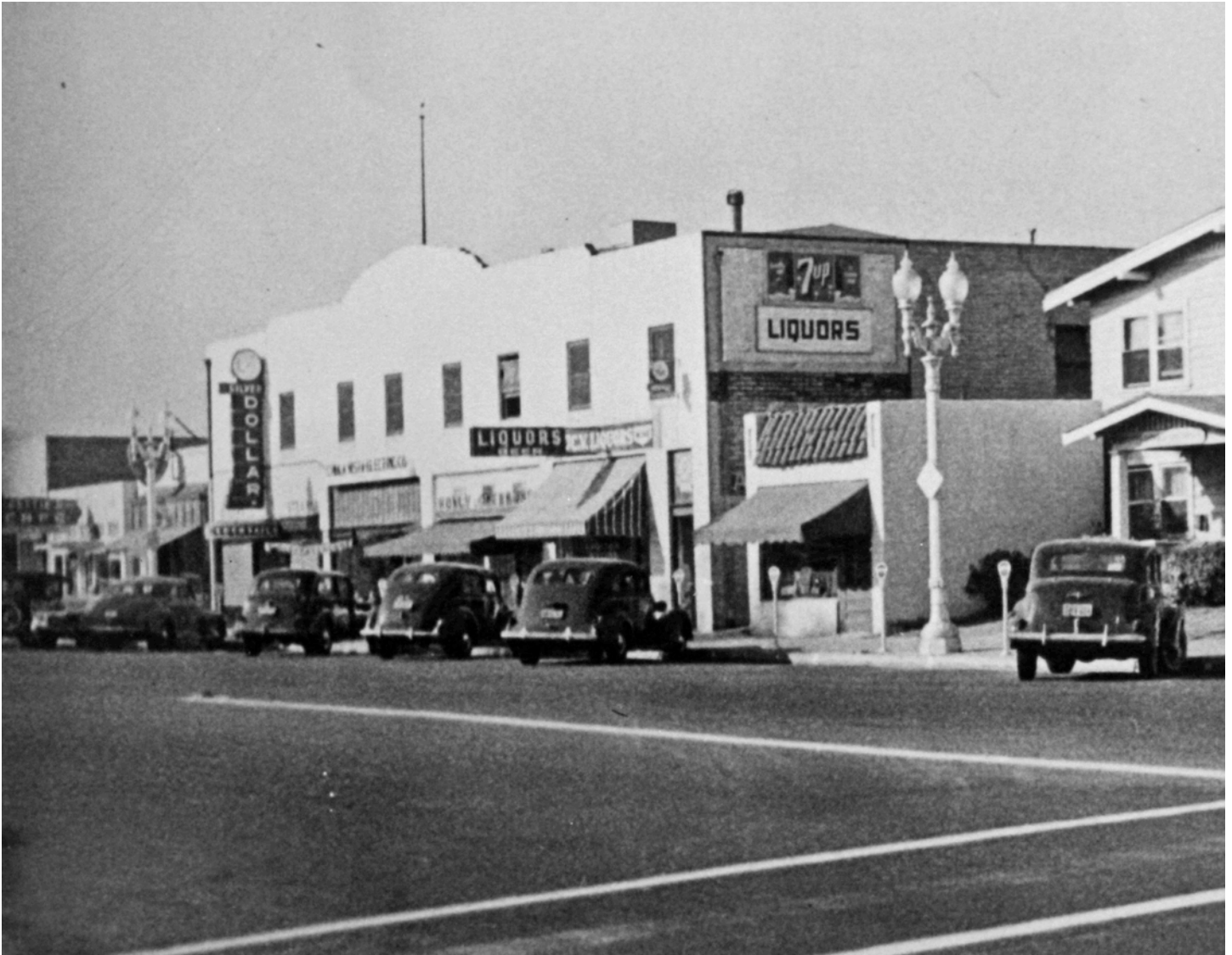
CENT 0236 from CV Library

1969/10/05 - Silver Dollar roof burned, at 341 3rd ave. ( Chula Vista Star-News, Oct. 5, 1969. )