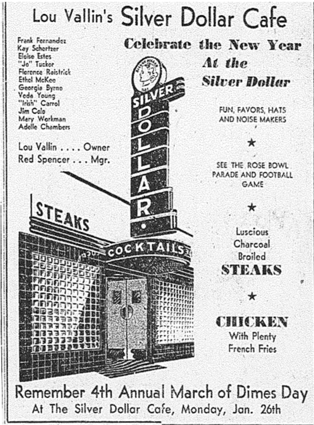
from Star 1953/1/6

Silver Dollar - This bar at 341 3rd Avenue was founded in 1934 by Willis Fullerton as the Owl Buffet. Starting in 1950, owner Lou Vallin led the annual March of Dimes campaign by donating the gross receipts for all drinks on the day designated as Silver Dollar Day. The Masonic Lodge met upstairs in this building from 1937 until 1955.